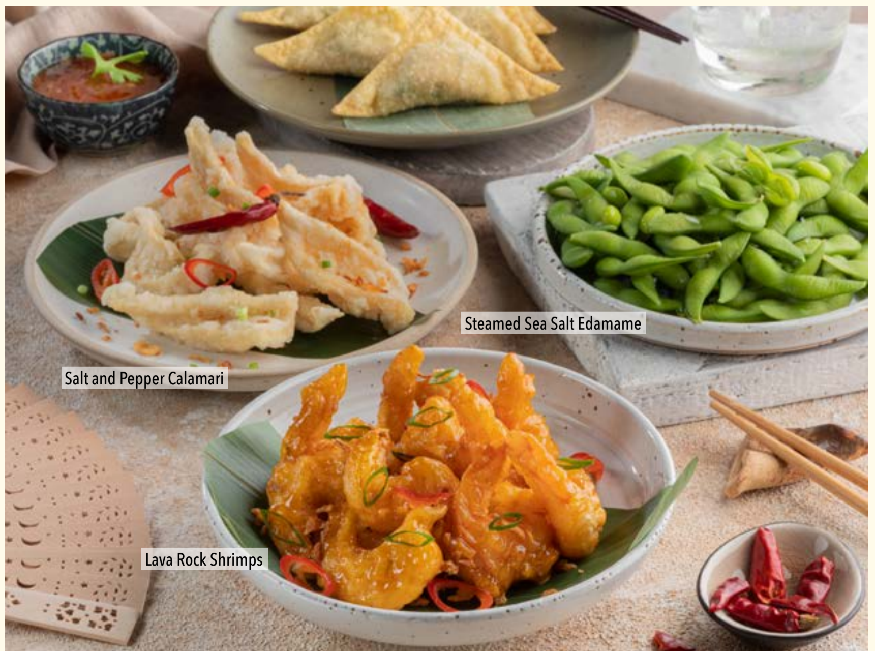
Salt and Pepper Calamari

We are here to ensure your dining experience is safe and enjoyable. Please inform our team about any allergies you may have.