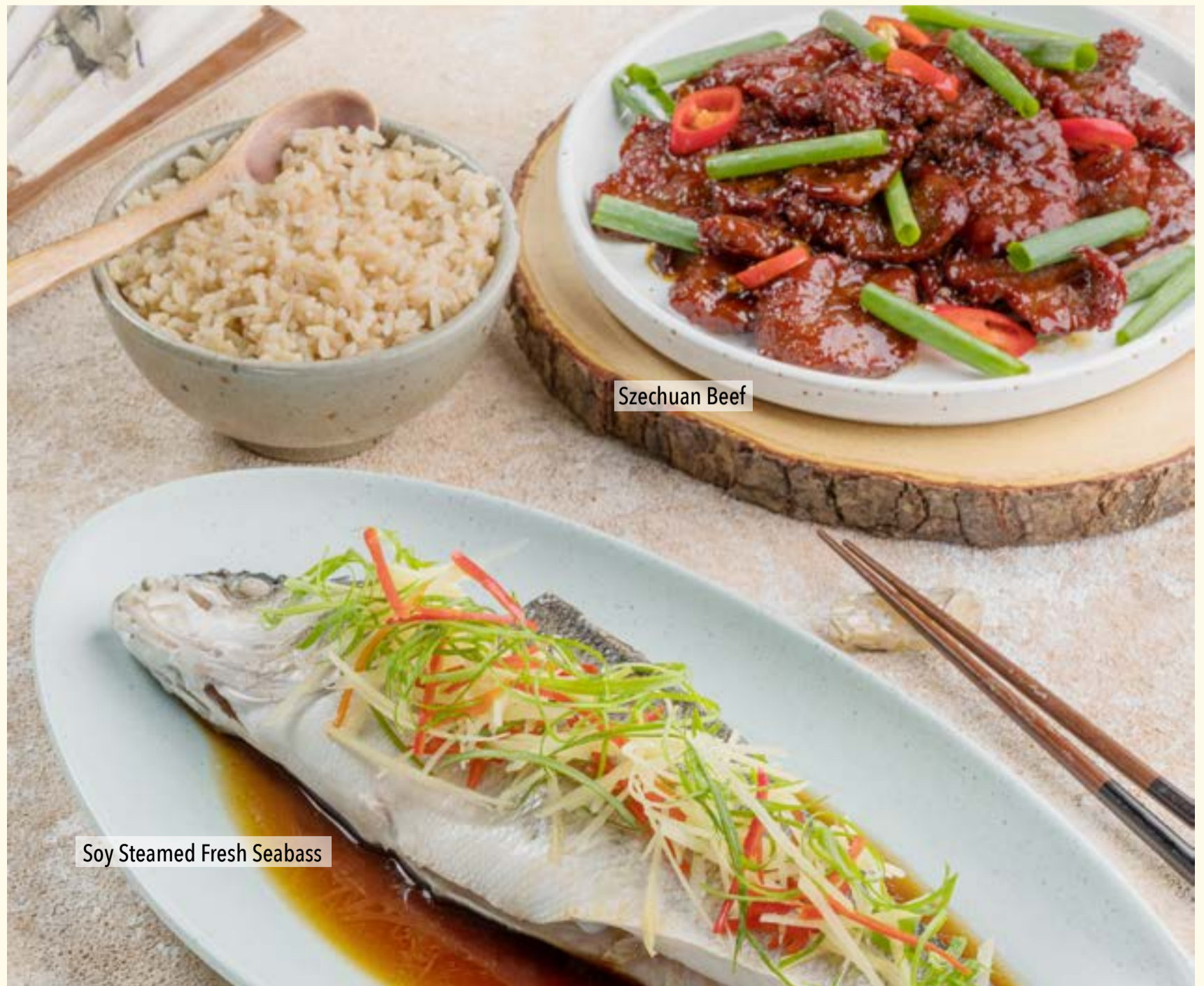
Soy Steamed Fresh Seabass

We are here to ensure your dining experience is safe and enjoyable. Please inform our team about any allergies you may have.