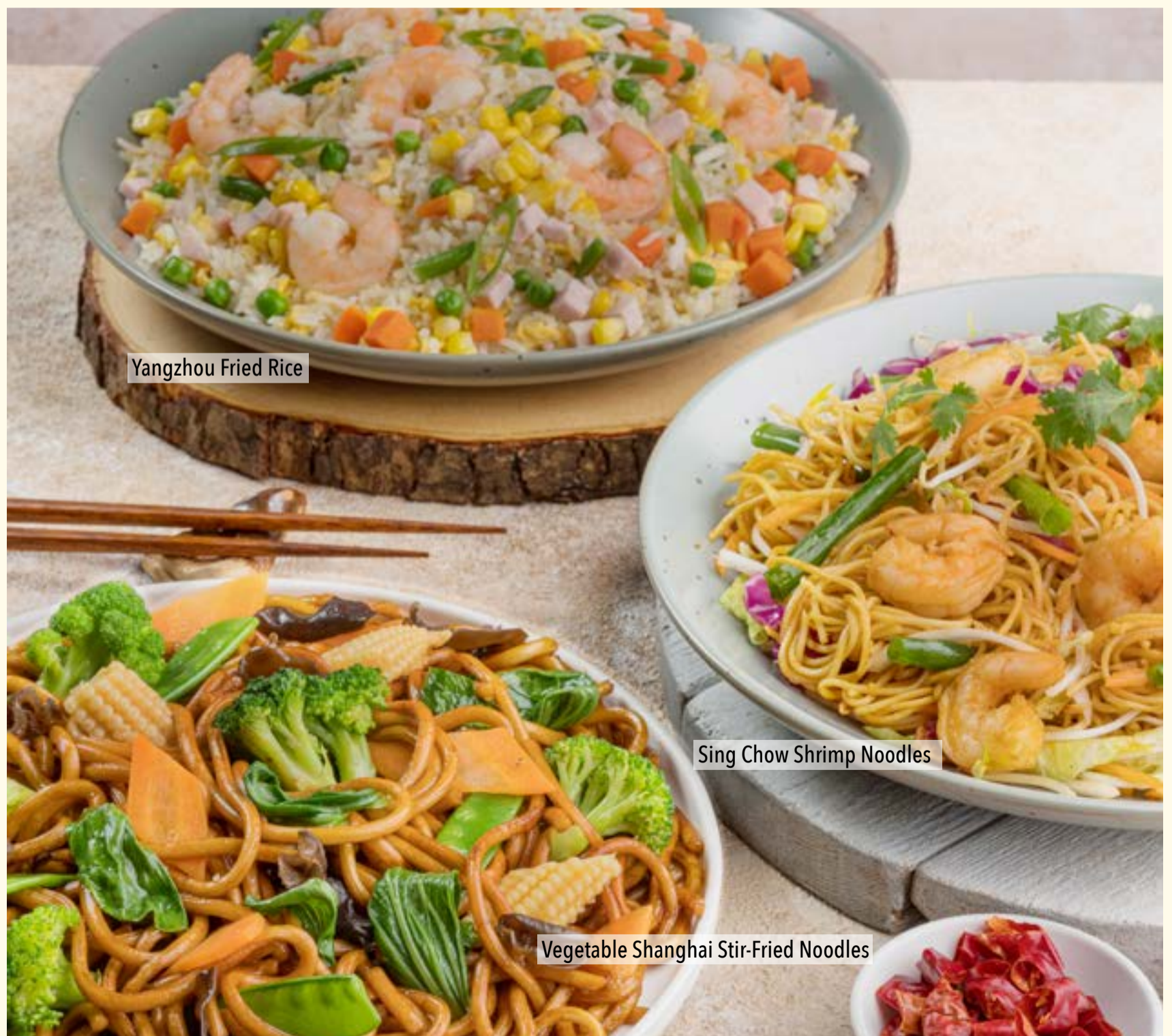
Yangzhou Fried Rice

We are here to ensure your dining experience is safe and enjoyable. Please inform our team about any allergies you may have.