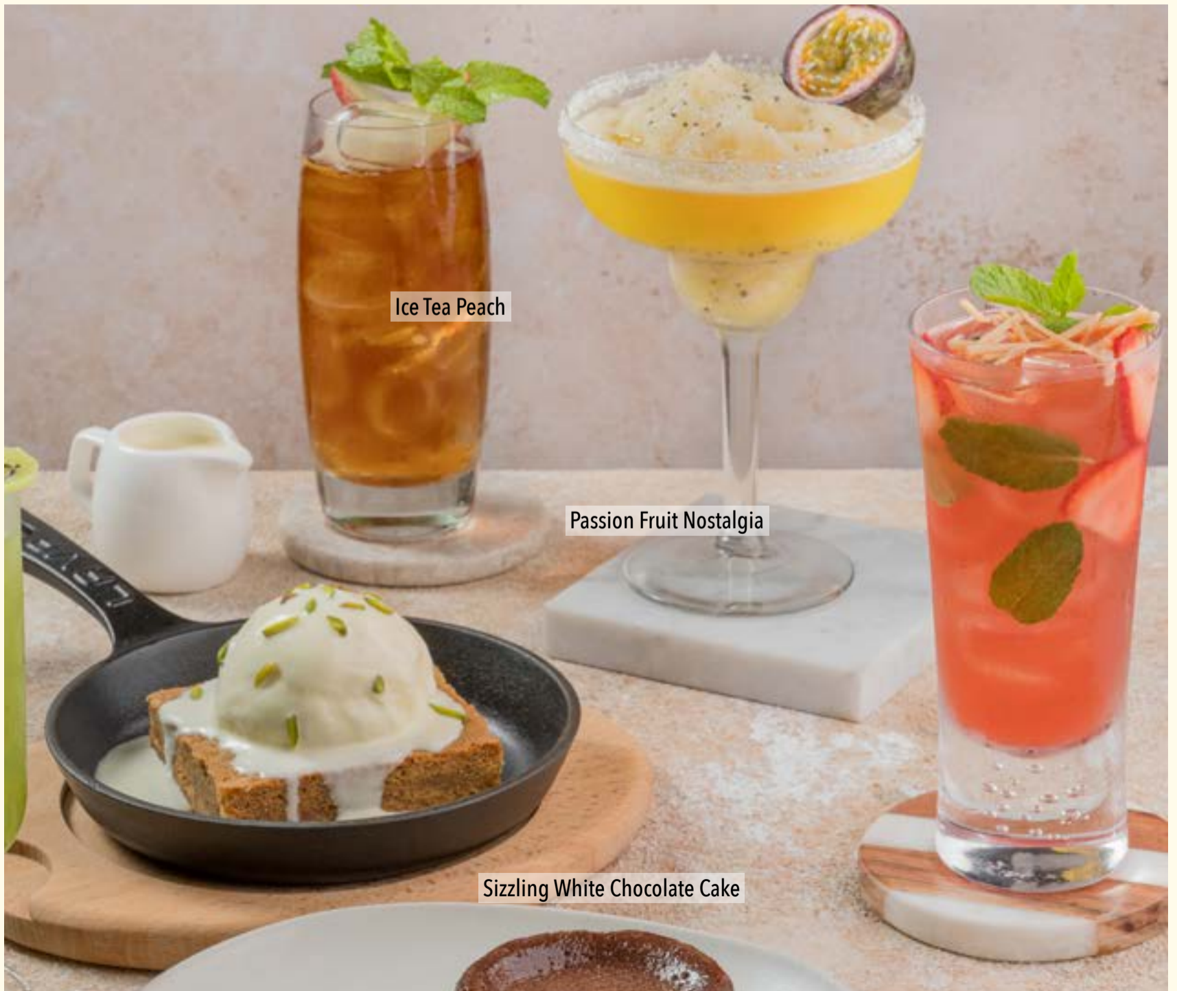
Ice Tea Peach

We are here to ensure your dining experience is safe and enjoyable. Please inform our team about any allergies you may have.